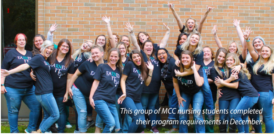
This group of MCC nursing students completed their program requirements in December.

contest was established in 2011 to encourage students to express and achieve their dreams.